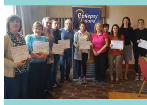
Over 2,100 people participated in our training programme on Epilepsy Awareness and the administration of Buccal Midazolam in 2018.

TFS also provides practical and inspirational experiences for people with epilepsy who, due to their condition have experienced difficulties in the progression of their educational and career aspirations.